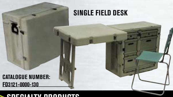
SINGLE FIELD DESK