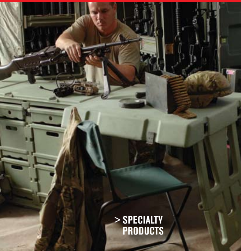
> SPECIALTY PRODUCTS