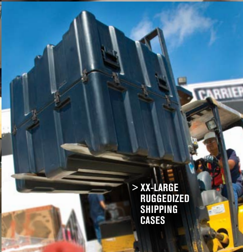
> XX-LARGE RUGGEDIZED SHIPPING CASES