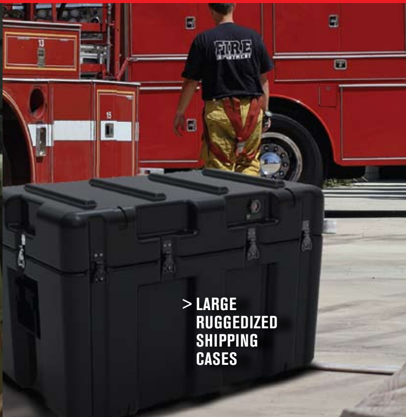
> LARGE RUGGEDIZED SHIPPING CASES