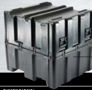
XX-LARGE RUGGEDIZED SHIPPING CASE CATALOGUE NUMBER: AL3834-1617-110

These cases are lightweight, shockproof, watertight, dustproof, heat, and chemical-resistant, which make them extremely tough and offer ultimate protection that will move your equipment from point A to point B without a scratch.